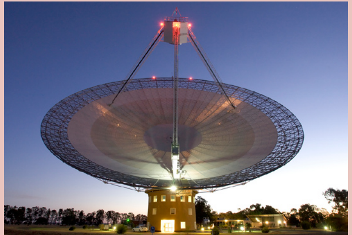
Would you like to use one of these as part of your job?

The old mantra "work smarter, not harder" is very relevant here, especially as data volumes continue to grow at an exponential rate. Two good articles on what it's like to be a PhD student and how to obtain a PhD are " How to be a Good Graduate Student " and " So Long, and Thanks for the PhD! ".