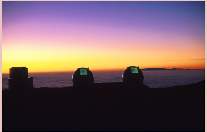
How would you like to work here?

Attributes of a good PhD student include a passion for research, a high level of motivation, well organized, and good verbal and written skills. As a student you will probably be working more than 40 hours a week (think apprentice), so it's important to work efficiently.