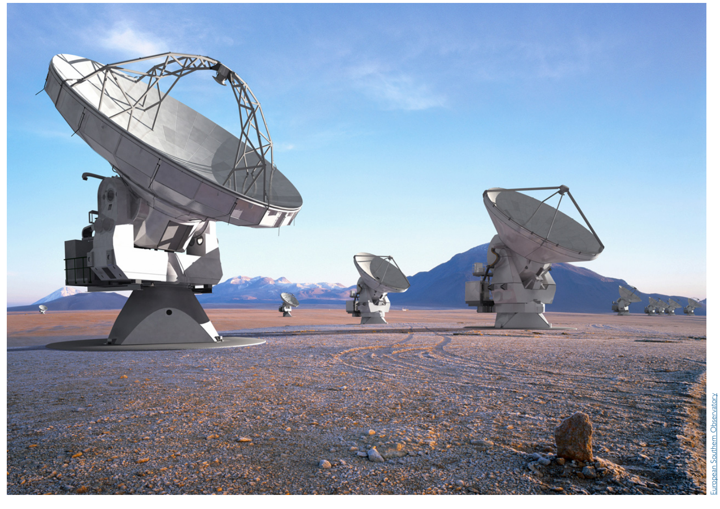
There are a number of new major observatories being planned or currently under construction, including the Atacama Large Millimeter/submillimeter Array (ALMA) in the Atacama Desert of northern Chile. While astronomy isn't a growth industry, there are still plenty of opportunities for eager researchers.

You'll have a better grasp of the big picture but probably at the expense of the technical details. Choosing your collaborators well is an important aspect of ongoing research success. You will increasingly multi-task, juggling teaching, community service, administra-