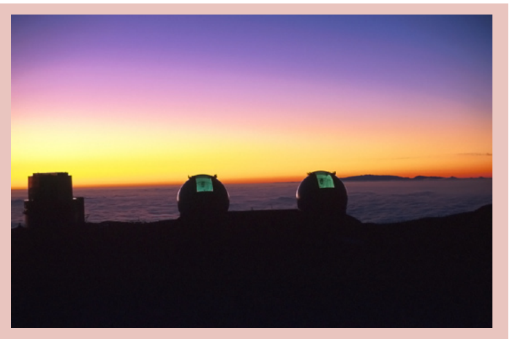
How would you like to work here?

Attributes of a good PhD student include a passion for research, a high level of motivation, well organized, and good verbal and written skills. As a student you will probably be working more than 40 hours a week (think apprentice), so it's important to work efficiently.