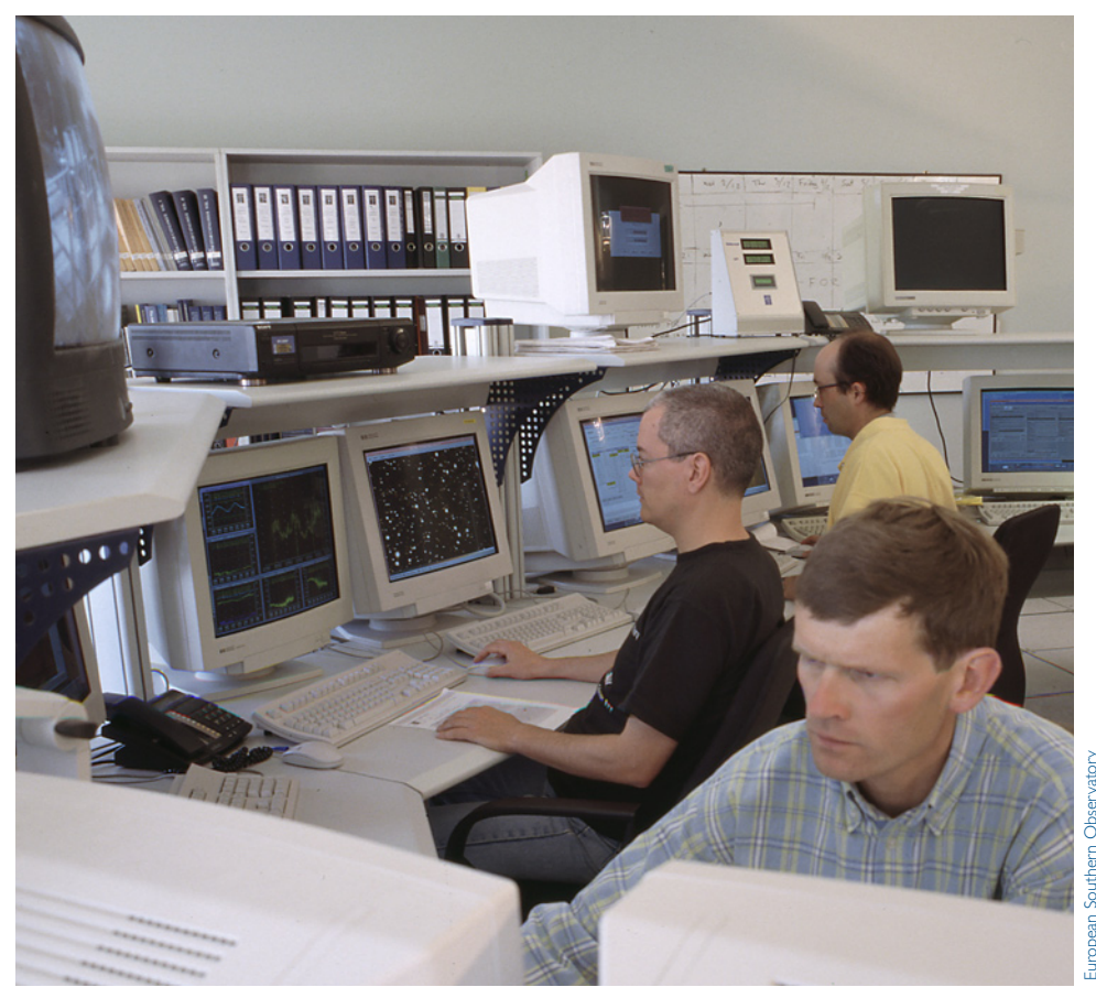
As a professional optical astronomer, you'll probably never look through the eyepiece of a large telescope. Instead, you'll spend your time manipulating instruments and "observing" from inside control rooms like this one. Some observatories even offer remote-observing capabilities that let you observe from the comfort of your own office.

So generally speaking there is a postdoc position in astronomy