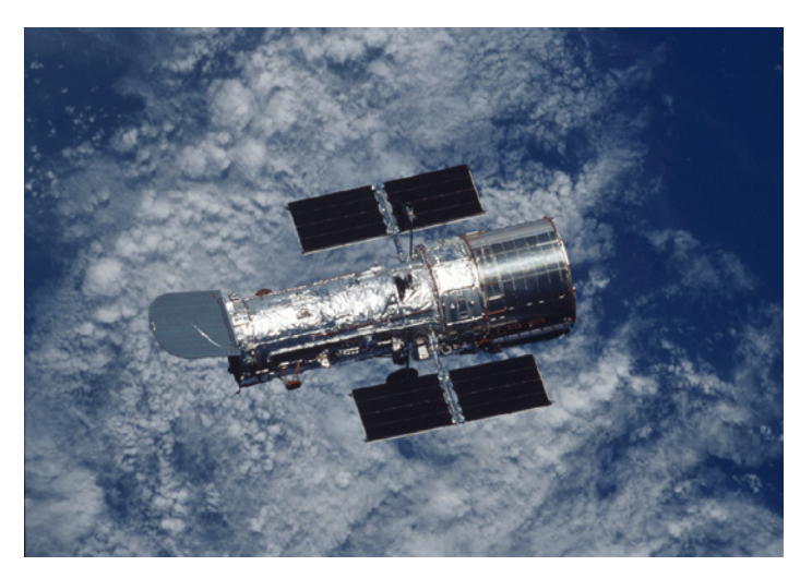
These days there are observatories on all seven continents and in space. While the Hubble Space Telescope's days may be numbered, other spacebased scopes are either in orbit (Spitzer Space Telescope) or on the way (James Webb Space Telescope).

With so many papers appearing daily, how do you make other astronomers aware of your work and get them to cite it? One solution is to tell them what you do by presenting seminars in