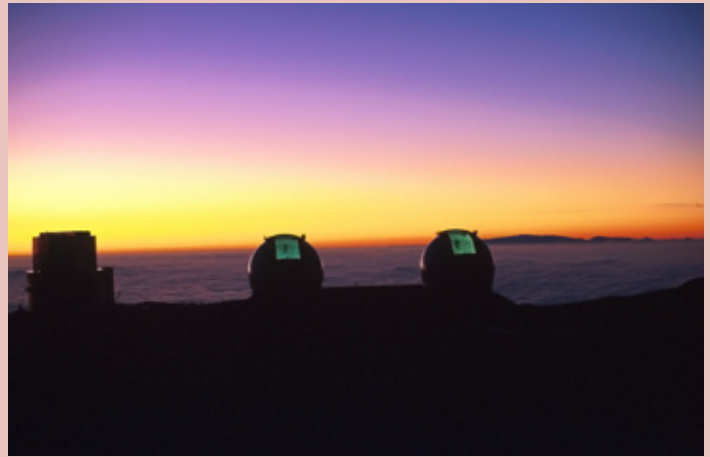
How would you like to work here?

Attributes of a good PhD student include a passion for research, a high level of motivation, well organized, and good verbal and written skills. As a student you will probably be working more than 40 hours a week (think apprentice), so it's important to work efficiently.