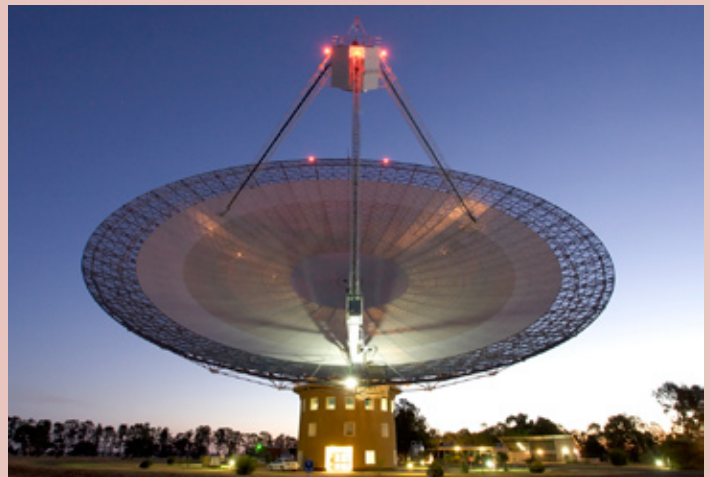
Would you like to use one of these as part of your job?

The old mantra "work smarter, not harder" is very relevant here, especially as data volumes continue to grow at an exponential rate. Two good articles on what it's like to be a PhD student and how to obtain a PhD are " How to be a Good Graduate Student " and " So Long, and Thanks for the PhD! ".